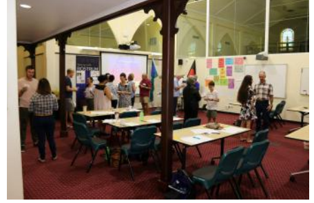
Rostrum training in action