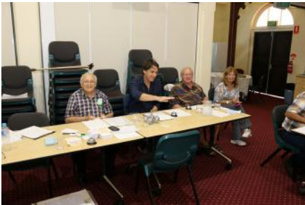
The Training Team