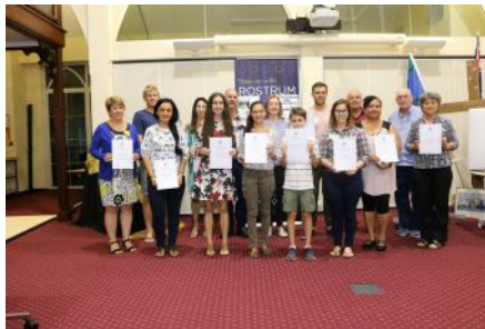
The successful participants with certificates